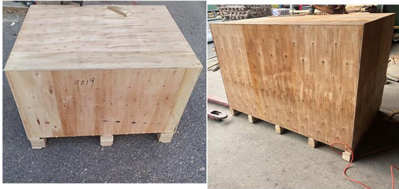
Factory workshop real shot